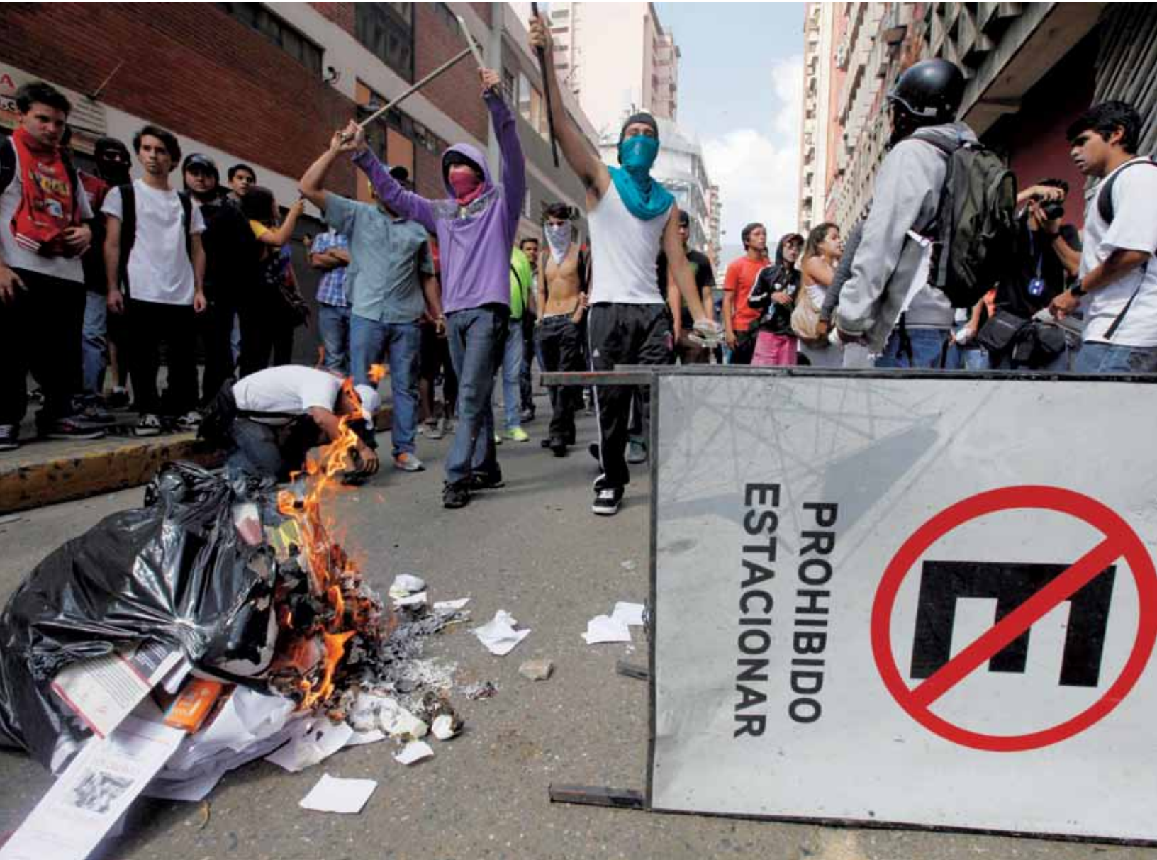
The loutish actions spread all over the country after the call to go on the streets made by Leopoldo López and María Corina.