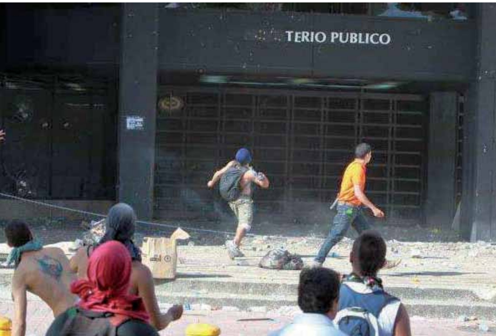
Attacks to the Headquarters of the Public Ministry in Caracas on February 12, 2014.