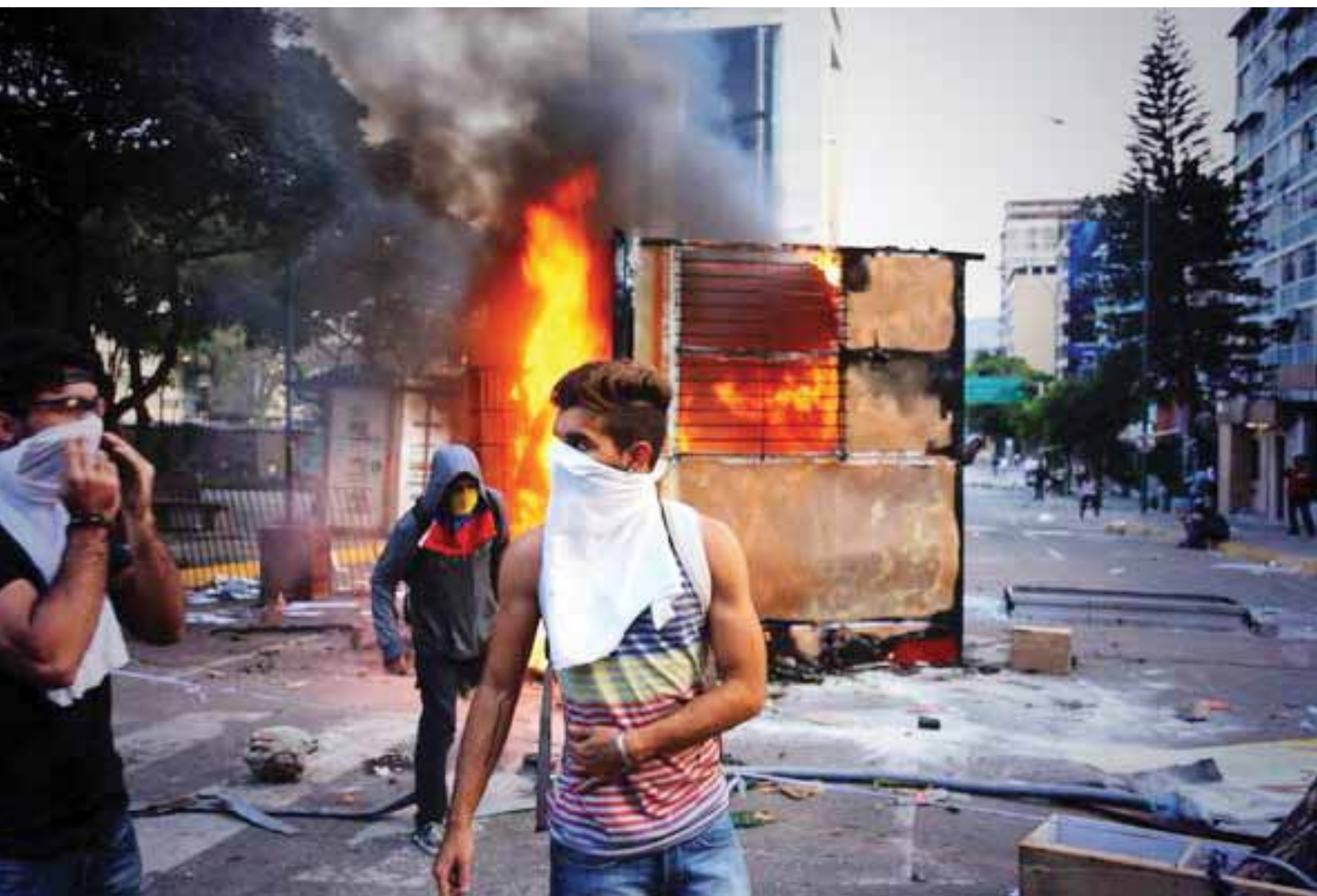
They destroyed and burned a service hut of superficial transportation – Metrobús – in the municipality of Chacao, Miranda.