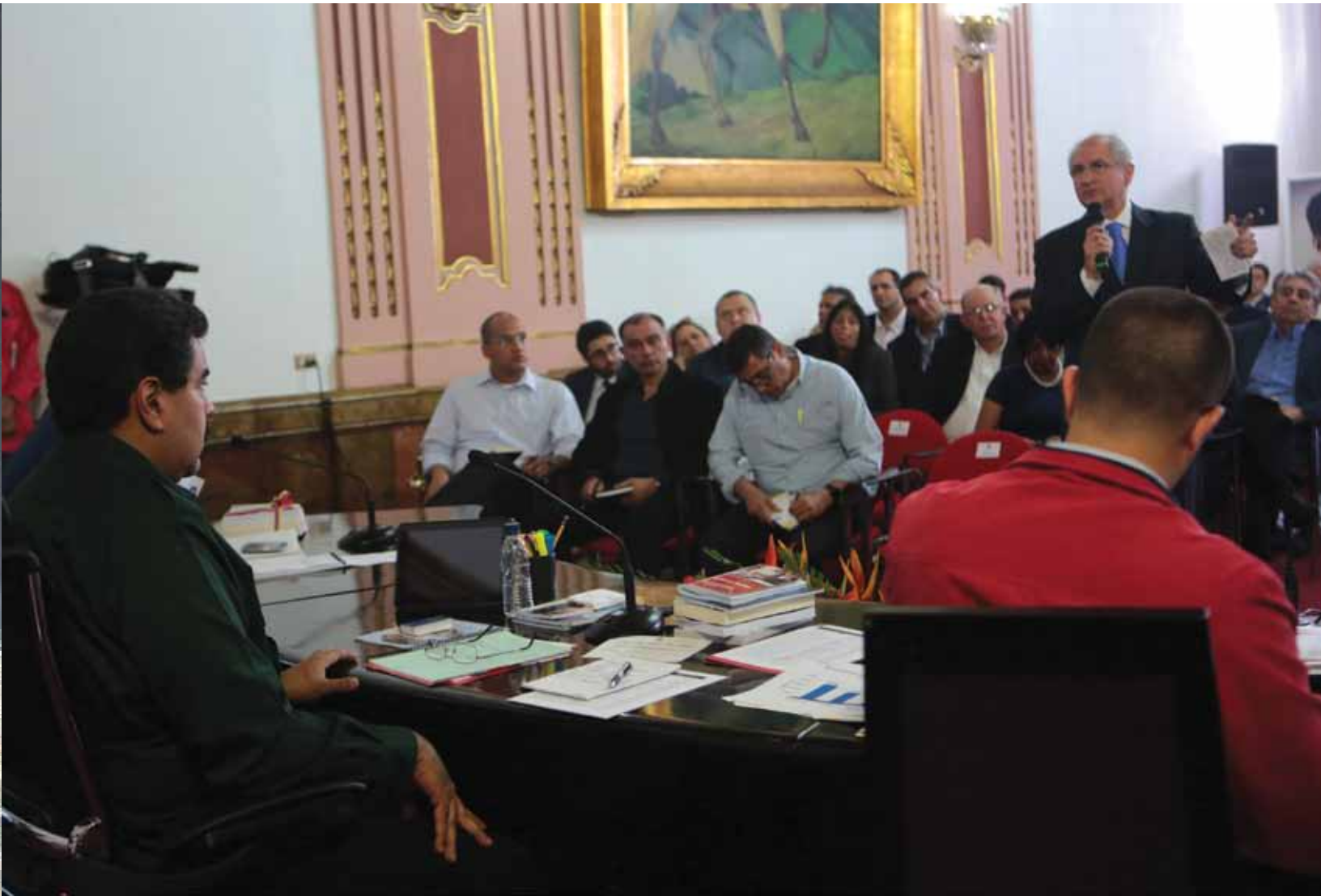
Session of the Government's Federal Council in Miraflores on December 18, 2014, called by President Nicolás Maduro; Governors and mayors of both revolutionary and right-winged parties attended.