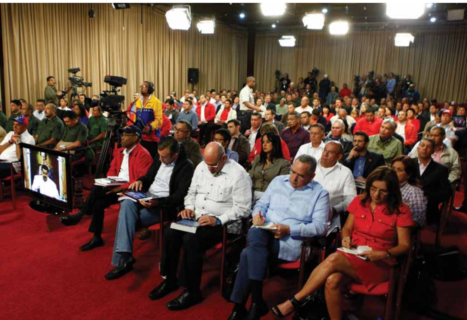
Second meeting held by President Maduro with the mayors and states’ governors both of opposition and revolutionary parties on January 8, 2014 in Miraflores, Caracas.

Despite categorizations, the practice of guarimbas uses young people as a key tool of terrorist violence by manipulating their emotions,